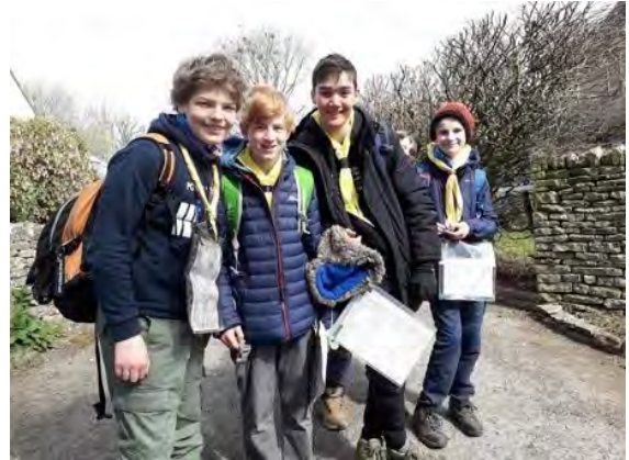
Yellow patrol on hike during weekend 1

Expedition Food was then prepared on Trangias, a new experience for many of the course, some of whom were doing the course as their first Scout Camp.