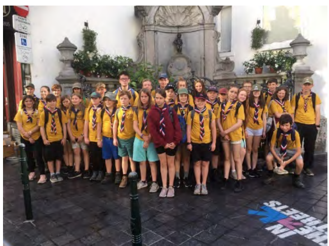
Scouts & Explorers from the Forest Of Dean in Brussels, Belgium