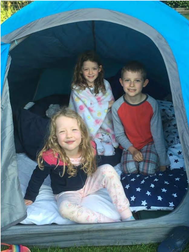
1st South Cerney Beavers