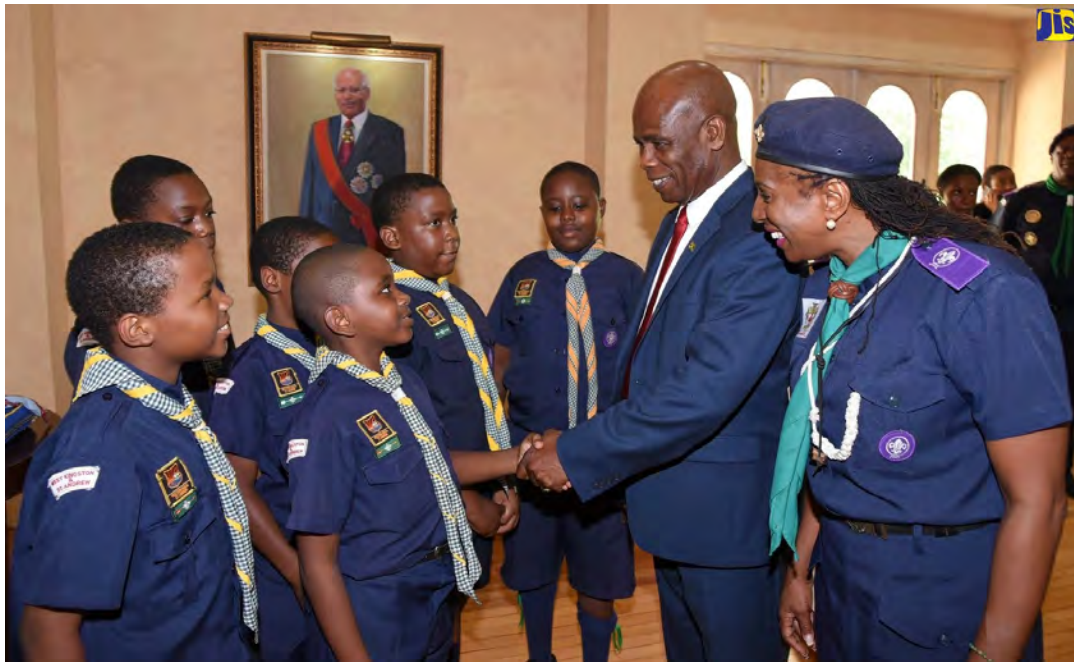
At the launch of Caribbean Cuboree 2019, at King's House, St. Andrew Parish, Kingston