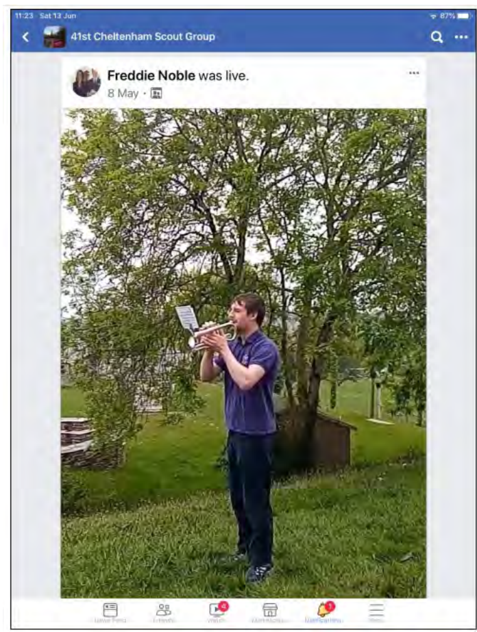
Recording on VE Day