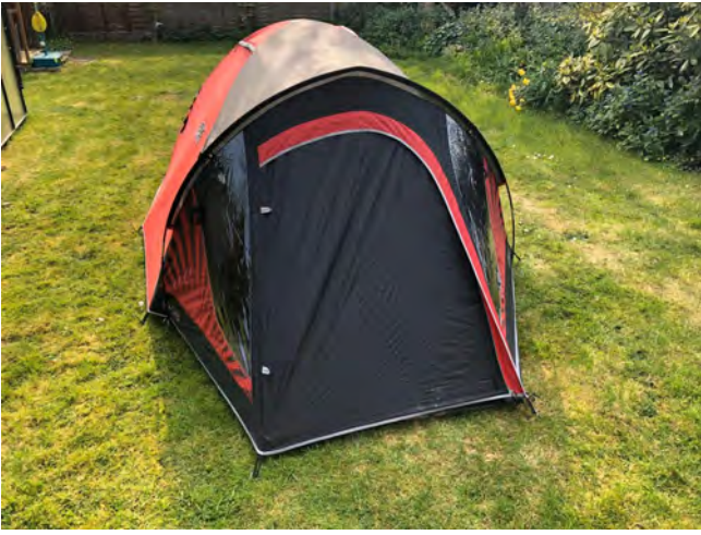
Camp at home