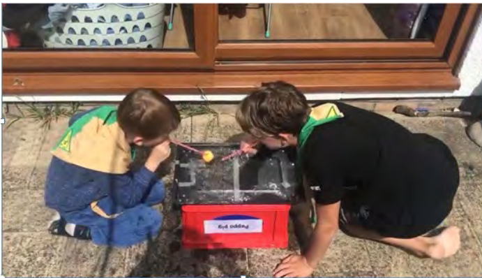
Water Football fun - 1st Dursley

the fun or complete it all in one day. It was great fun for us putting the videos together and we saw lots of photos and videos of the young people around the County joining in too. We will be releasing a slide show of these shortly.