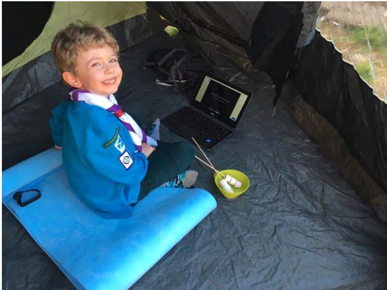
A Scottish Beaver enjoying himself camping at home