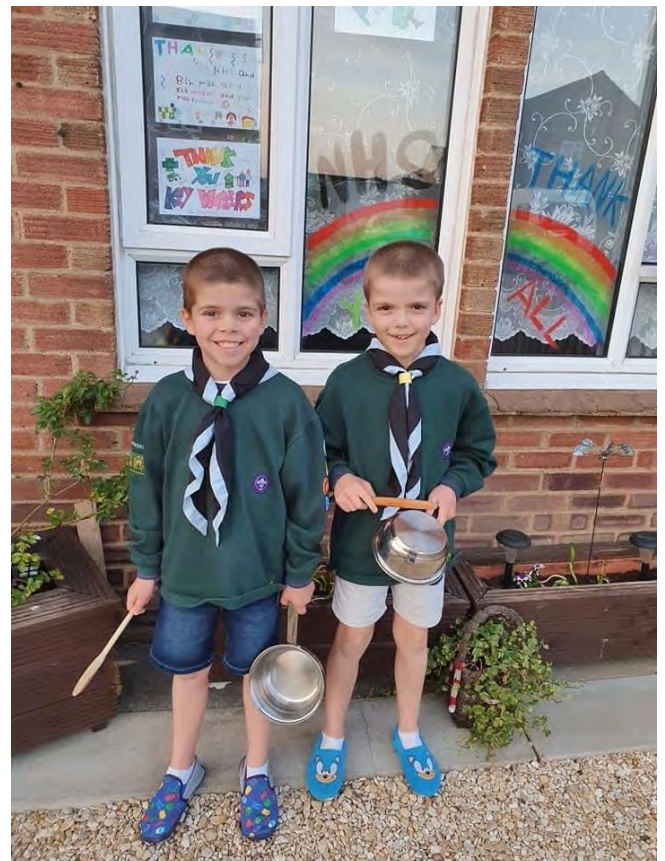
1st Hatherley Scouts