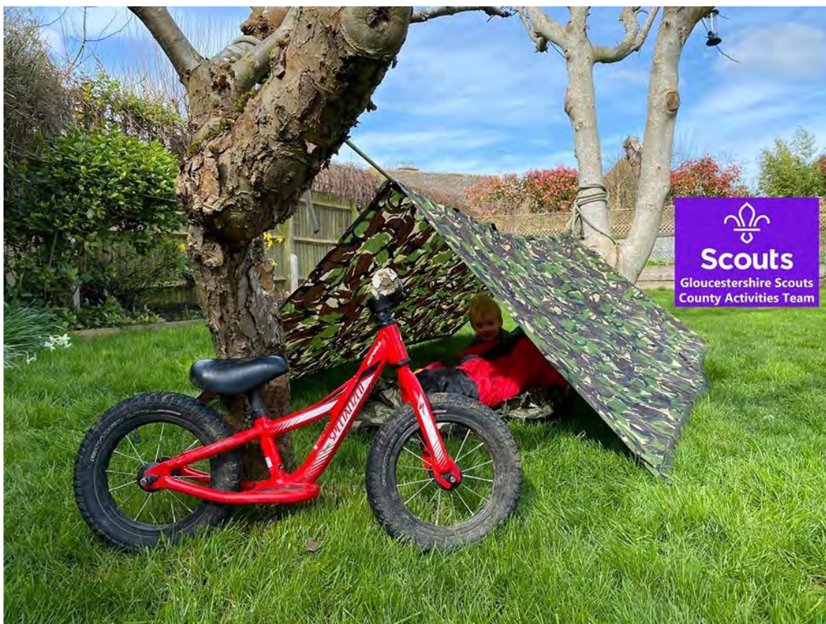
Camp at Home