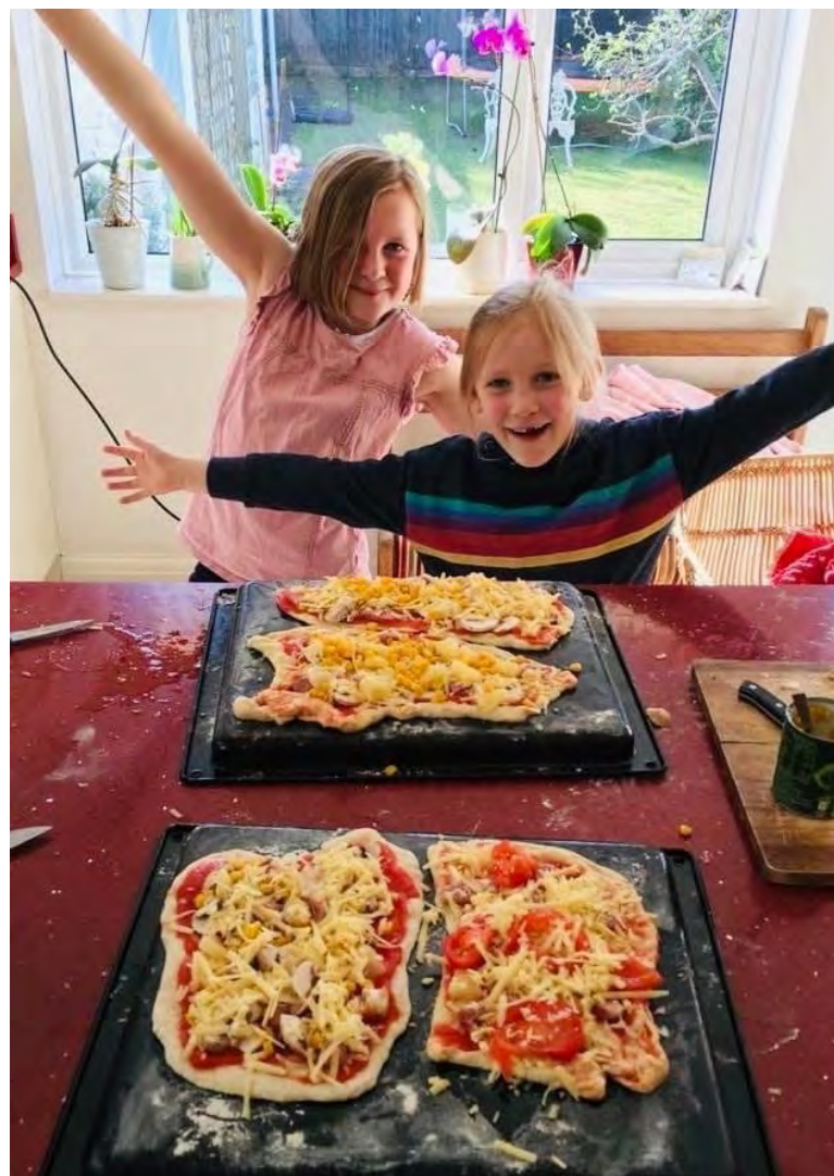
10th Cheltenham (All Saints) - International Cooks Badge@home