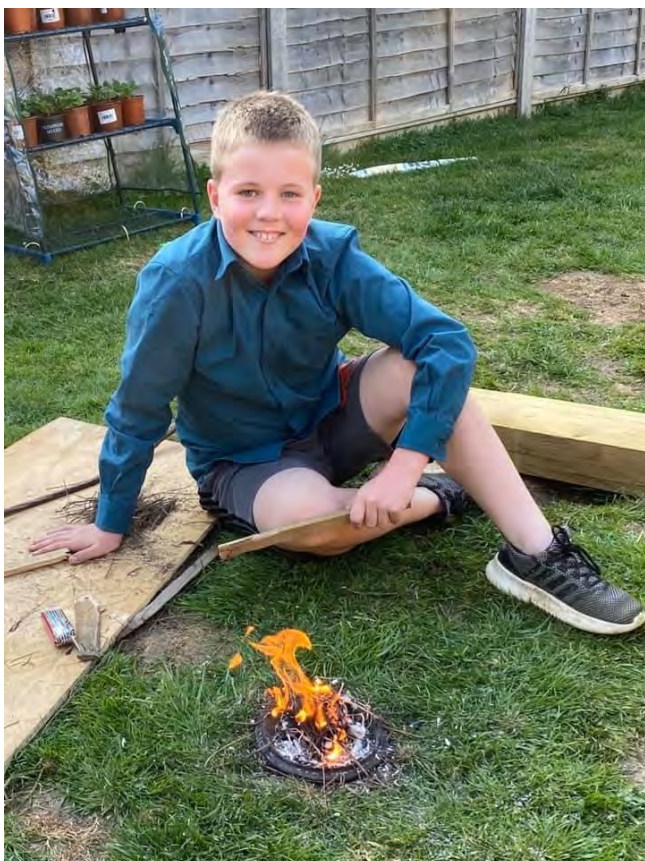
Prestbury Scout missing the Troop meetings